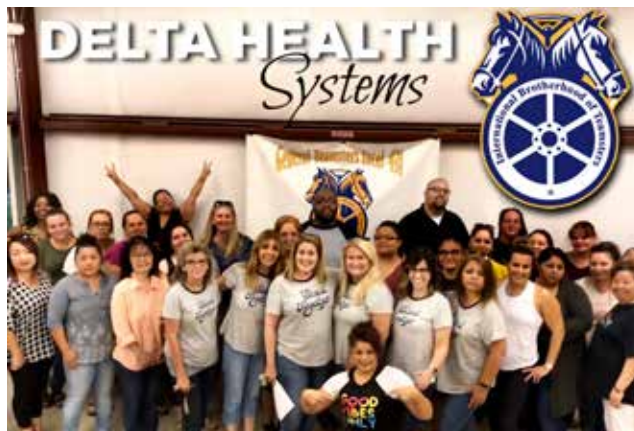
The members at Delta Health Systems were proud to ratify their new contract.

Finally, the Local recently won an arbitration against Bradley Tanks, Inc. resulting in the company having to pay back dues and initiation fees to the Local for failing to inform the Local about 50 new construction employees.