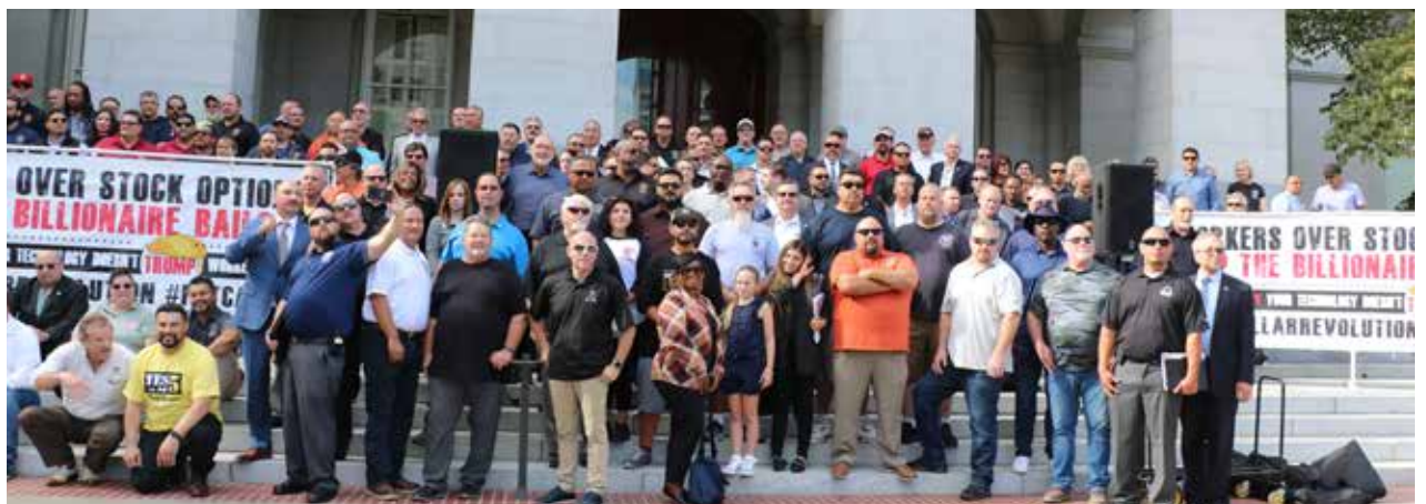
Teamsters, Building Trades workers, and other union members at a Lobby Day on September 5, to push the State Senate to vote for AB5 without further amendments, and the Assembly to give the final push for passage. Below, larger than life “fat cats” represent Uber, Lyft, Handy and other gig economy companies that are misclassifying employees as independent contractors.

“By approving AB5, the California legislature solidified our state’s position as the national leader on workplace rights, setting the standard for the rest of the country to follow,” said California Labor Federation Executive Secretary-Treasurer Art Pulaski in a statement. “The misclassification of workers creates a corrosive effect that ripples through our entire economy, undermining our laws to protect and support working people. AB5 is a powerful counter to the corporate greed and rampant exploitation that’s driving inequality across our state in emerging and traditional industries, alike.”