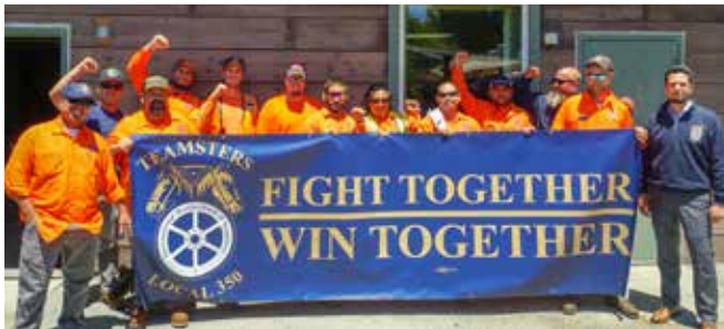
Members in Los Altos unanimously approve new M.O.U.

The men and women of this unit provide a broad spectrum of services throughout the City of Los