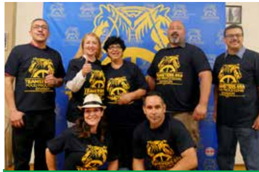
Members of Local 856's new Food Processing Division.

In June, with a resounding 90% yes vote, the members of Teamsters Local 601 voted to merge with Local 856. Their goal for the merger is to increase member strength, build on the current Teamster Central Valley infrastructure, and advance organizing opportunities, while maintaining local control. Local 856 is fully committed to meeting those goals.