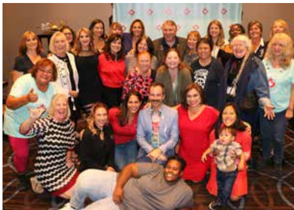
1,200 Teamster women and a few men turned out for the annual 2019 Teamsters Women's Conference in Montreal, Canada in September. Here's some of the Joint Council 7 delegation pictured with General President Jim Hoffa.