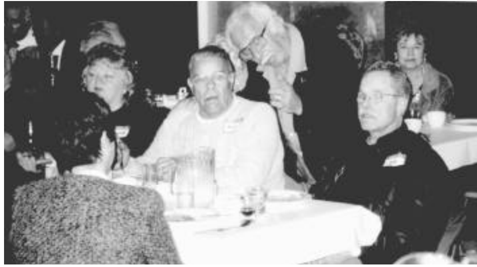
Attendees at the 2002 East Bay Retiree Club Luncheon. The 30th Annual East Bay Teamsters Retiree Club Luncheon will be held on April 16. See Bulletin Board for details.