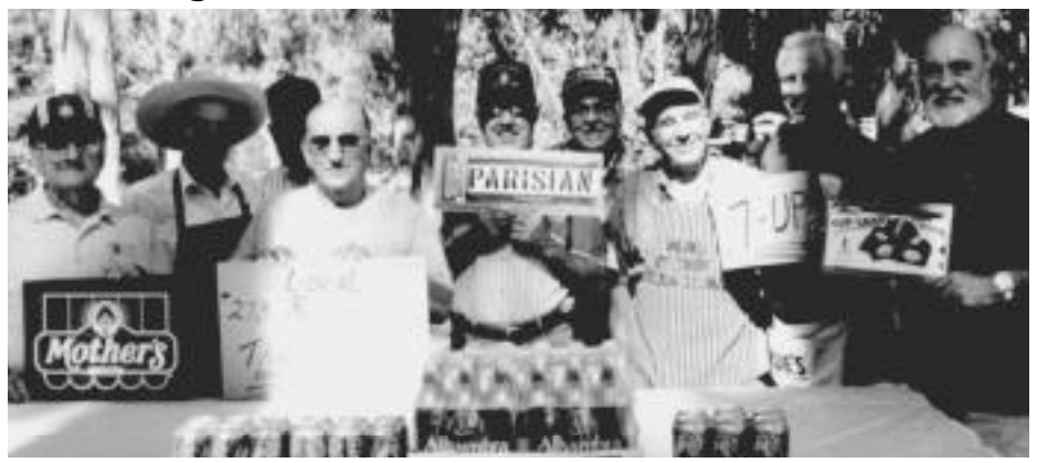
With 115 members and guests in attendance, Local 278's Retiree Club picnic was a great success. Many union companies donated great prizes. We expect the 2003 Picnic to be even better!