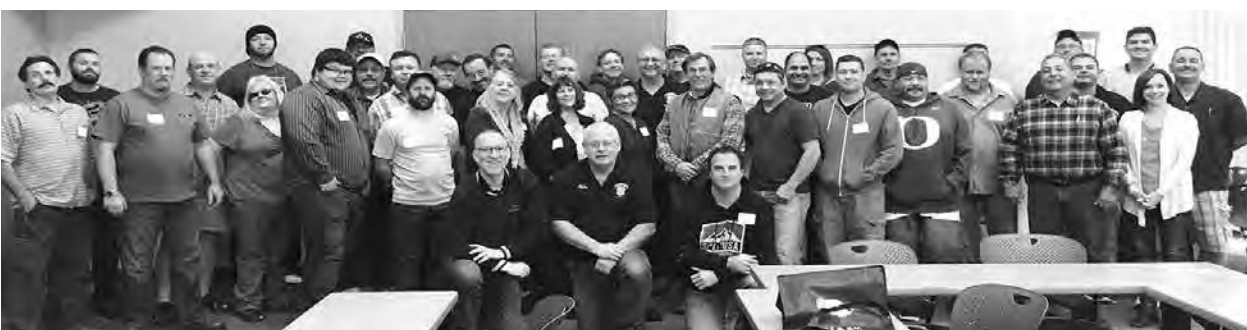
Local 137 stewards and activists spent a day in November honing their steward skills.

We encourage anyone who is ready to make a difference to come to a union meeting, contact their union representative, and most importantly, become a full-voting member of the Teamsters. Together, we will create a better UC.