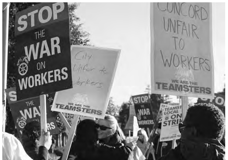
Members who work for the City of Concord took to the streets for fairness on November 18.