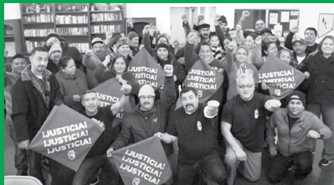
Workers learn that the Labor Board finally issued an order demanding that Taylor Farms bargain with the Teamsters on their behalf.

In March, 2014, the workers at a Taylor Farms' food processing unit in Tracy voted on having union representation. However, the election was so fraught with irregularities that the National Labor Relations Board confiscated the ballots. Twenty months later, in December, 2015, the Board determined that the company had committed so many unfair labor practices, a fair election was unlikely to be possible. They issued a bargaining order, meaning that Taylor Farms had to bargain with Teamsters Local 601.