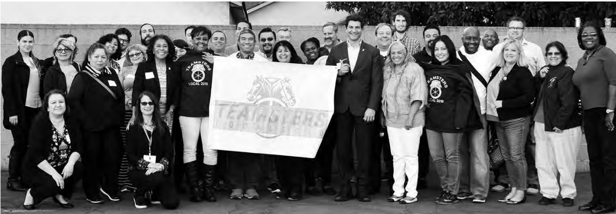
This is just a small group of the hundreds of steward activists/leaders trained throughout the UC system.

When Teamsters Local 2010 set out to build a strong network of union stewards in 2013, it seemed overly-ambitious to some, and to many, just flat-out impossible. However, in just two years of conversations and trainings, we can confidently say that we have achieved just that.