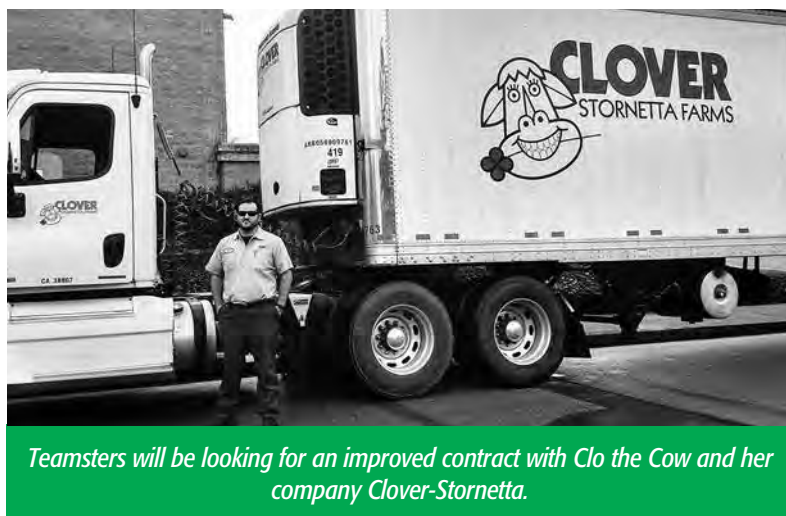
Teamsters will be looking for an improved contract with Clo the Cow and her company Clover-Stornetta.

Contract talks will certainly include discussion of