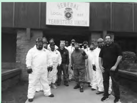
Local 431's first "Hazwoper" class gets certified to do work on High Speed Rail.

Local 431 is readying its members for the High Speed Rail project to get into high gear. Many aspects of the project will bring more work to the Central Valley. Much of this work will be done by Teamsters, such as demolition, hazmat abatement and much more.